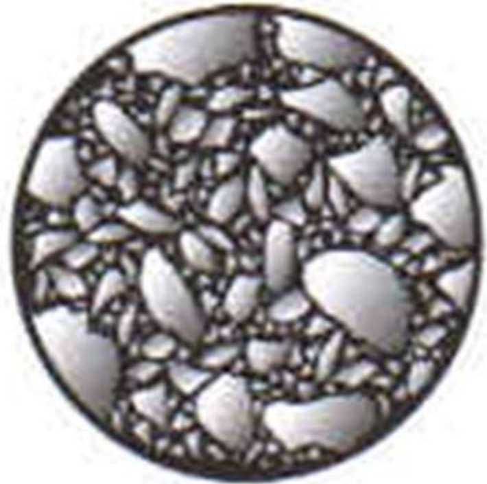
MMA typu AC (Asphalt Concrete)