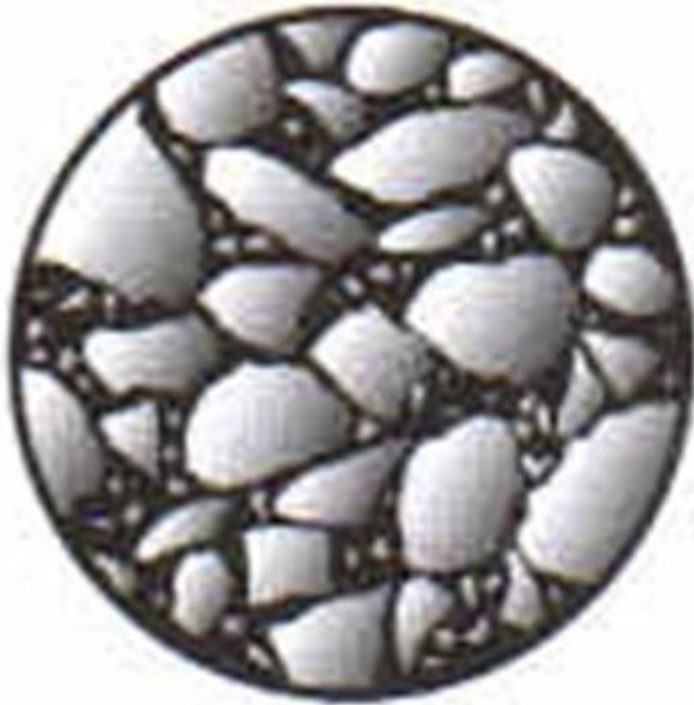
MMA typu SMA (Stone Mastic Asphalt)